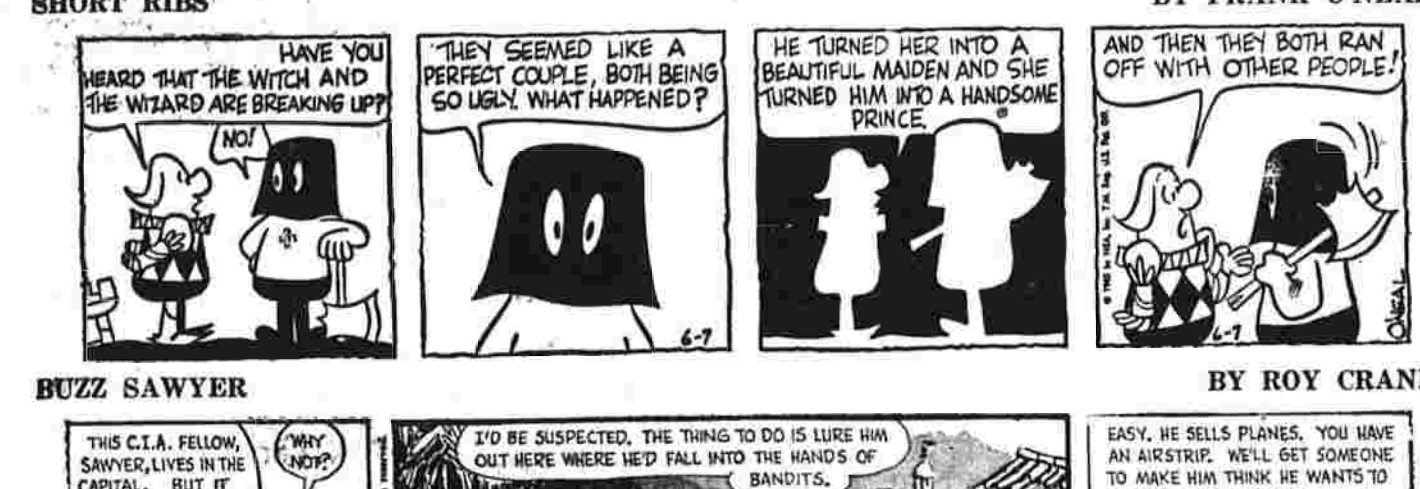
BY FRANK O'NEAL