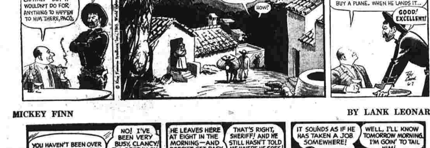
BY ROY CRANE