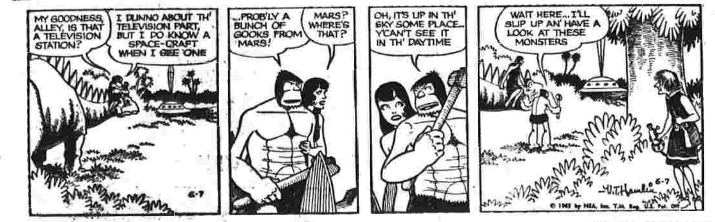
BY DICK TURNER