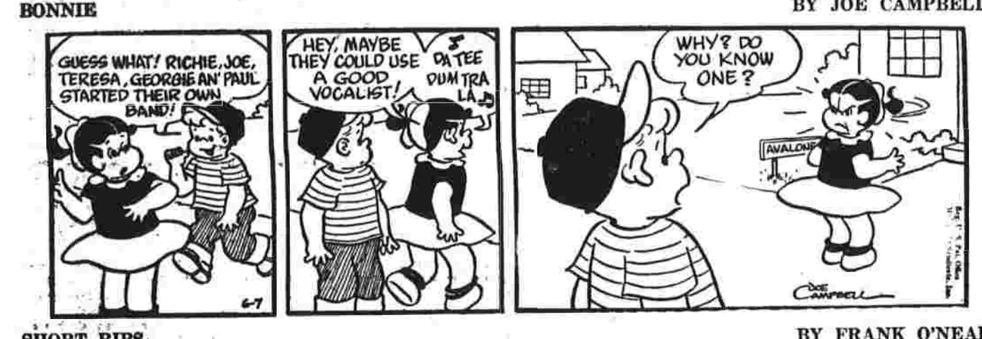
BY JOE CAMPBELL